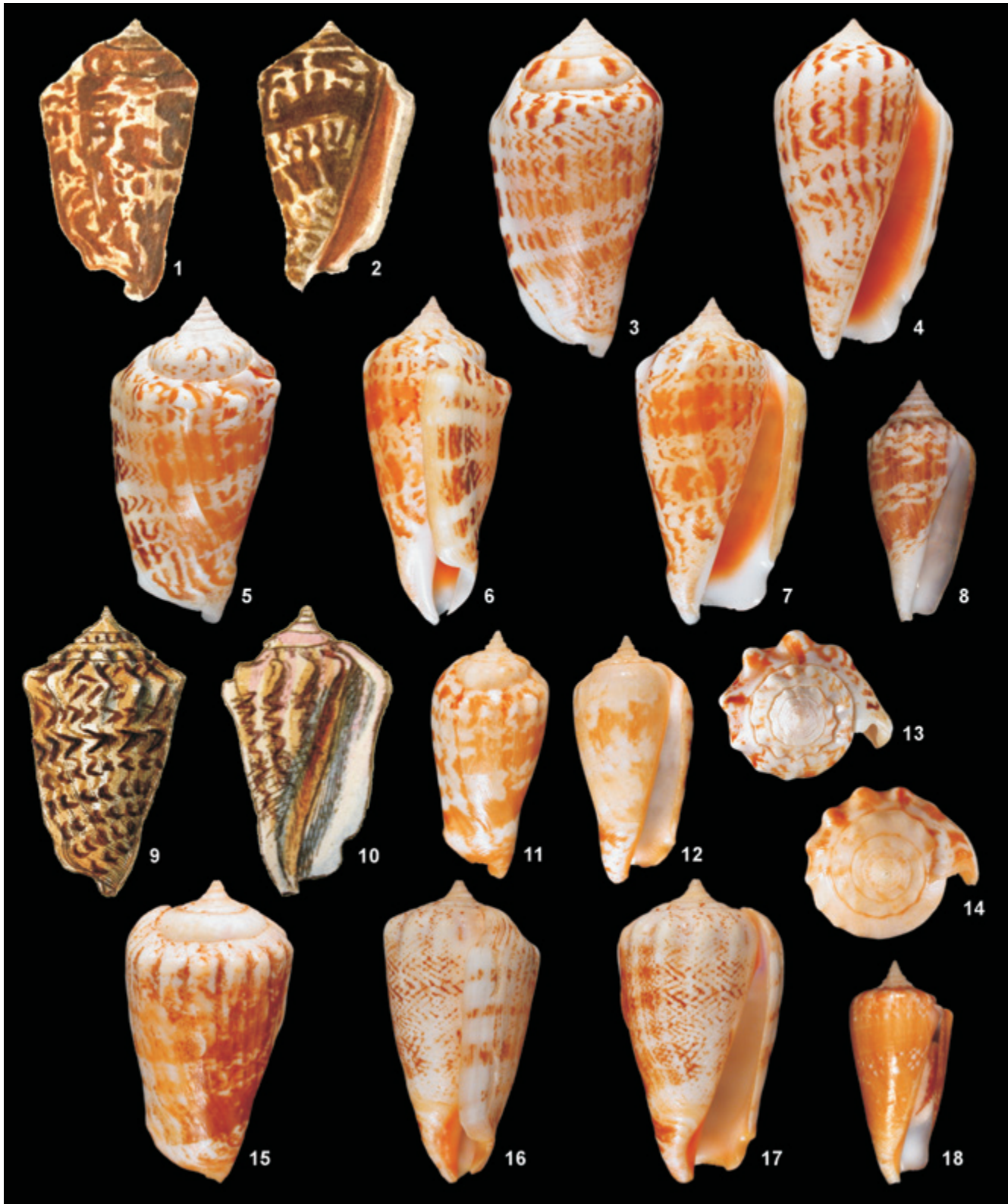
Figs 1-8, 13 Conomurex decorus (Röding, 1798). 9-12, 14-18. Conomurex coniformis (Sowerby II, 1842). 1-2 Original figures of Lambis decora Röding from Chemnitz, 1788, Conchylien Cabinet: pl. 157 figs 1499-1500. 3-4 Madagascar, Tuléar, Anakao, 57 mm, VL 900-09. 5-7,13 Madagascar, Tuléar, Anakao, 54 mm, VL 900-10. 8 Juvenile, Tanzania, Zanzibar, Nungwi, beached, 40 mm, VL 900-15. 9-10 Original figures of Strombus coniformis from Sowerby, Thesaurus Conchyliorum: pl. 7 figs 55,61. 11-12 Jemen, Socotra, 32 mm, VL 905-05. 14-17 Somalia, Cape Guardafui, shallow water, 49 mm, VL 905-04. 18 Juvenile, Somalia, Brava, shallow water among seagrass, 37 mm, VL 905-03.